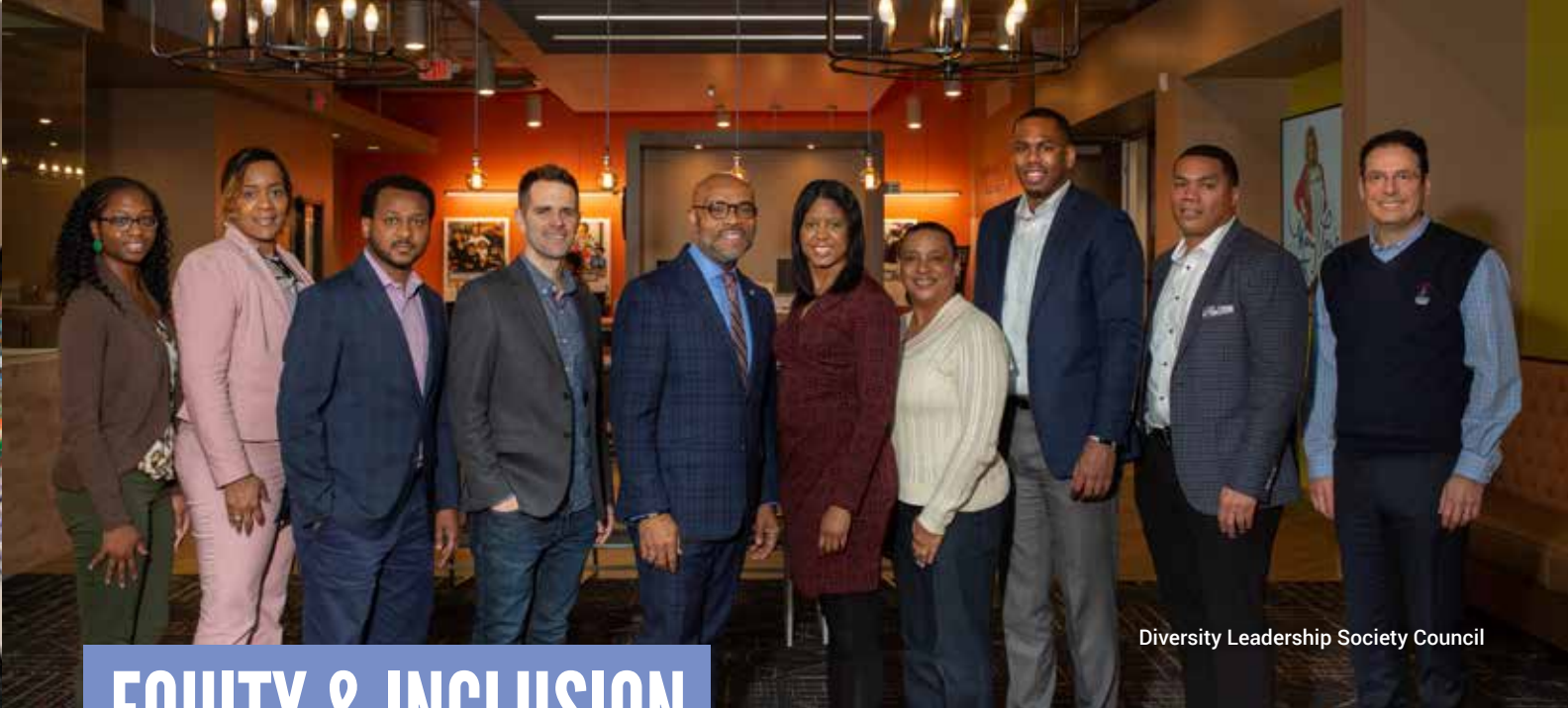
Diversity Leadership Society Council