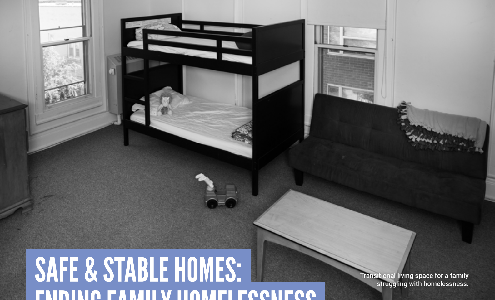
Transitional living space for a family struggling with homelessness.