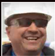
Nolberto PPG Industries