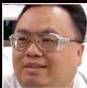
Teng Rockwell Automation