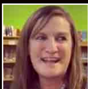
Mary Swanson Elementary School