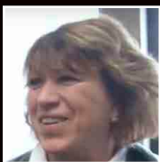
Cynthia Marcus Center