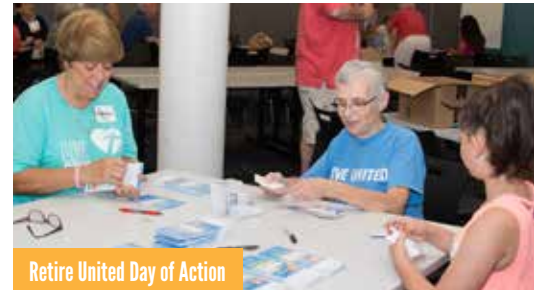
Retire United Day of Action

Thanks to the many sponsors of our Donor Network events and programs, including Harley-Davidson Motor Company, Vesta Senior Network, BMO Harris Bank, MillerCoors and the Milwaukee Business Journal.