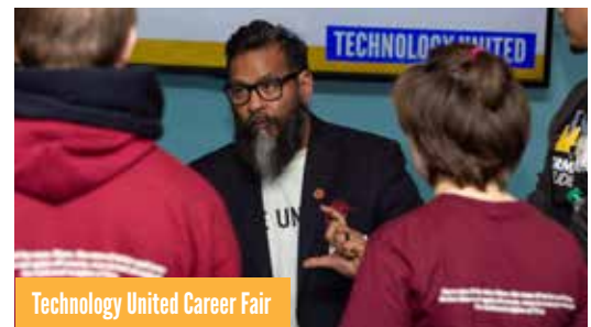
Technology United Career Fair