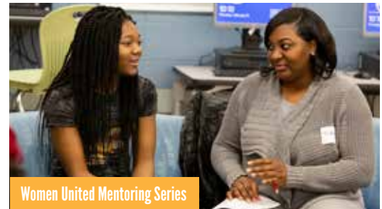
Women United Mentoring Series

Learn More at UnitedWayGMWC.org/DonorNetworks