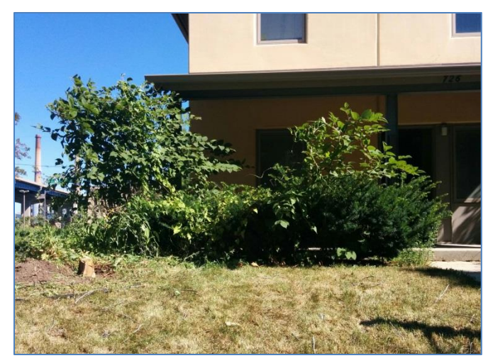
Before – Front View of Milwaukee Idea Home