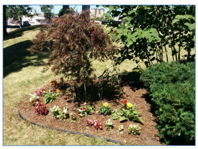
After – Front View of Milwaukee Idea Home