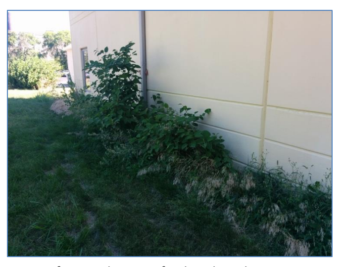
Before – Side View of Milwaukee Idea Home