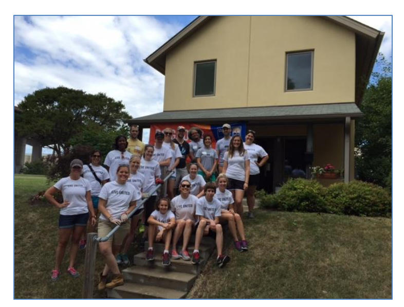
Volunteers from LINC (Lead, Impact, Network, Change) worked together at IndependenceFirst's Milwaukee Idea Home on Saturday, August 1, 2015.